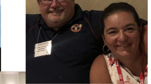
Some of the FUN at the Annual NYSMA Convention